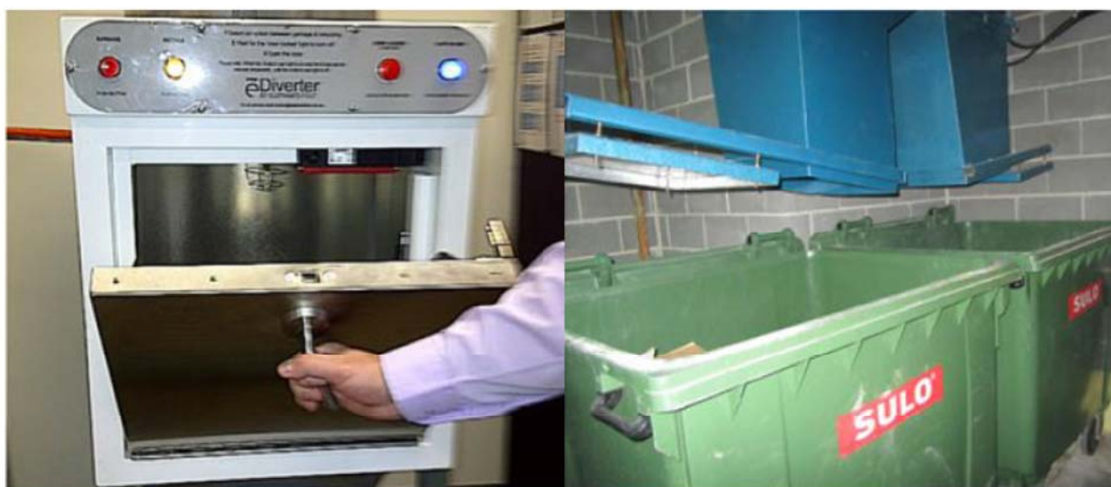
Figure 1 eDiverter Waste Chutes for Residential Multi-use Developments

To use the system the resident will select the recycling or waste function. This moves a mechanism that guides recycling or waste into the correct collection bin located in the basement. An example of the chute system is shown below in Figure 1 .