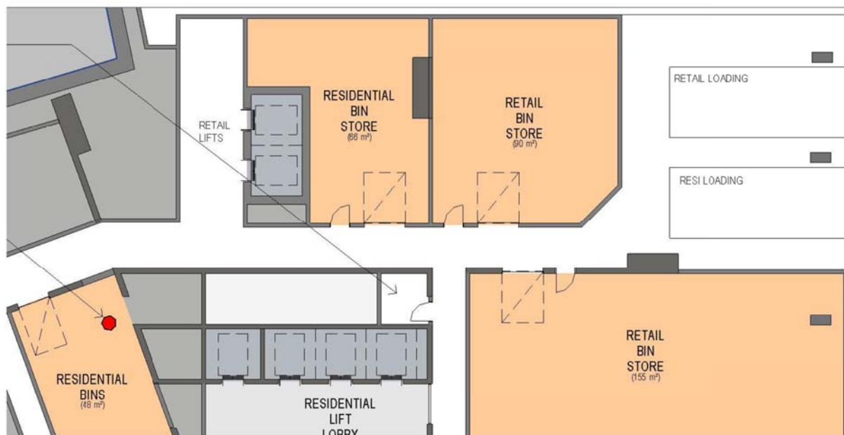
Figure 2 Preliminary Basement Plan Bin Storage and Location of Chute

Following further consultation with the City of Sydney, SLR has prepared two scenarios for the waste storage area requirements: